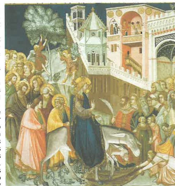
Christ's entry into Jerusalem, Pietro Lorenzetti, Basilica of San Francesco d'Assisi

Pope Francis has indeed given us a beautiful theme for this Jubilee Year 2025 – to be pilgrims of hope. From our own birth to our own death we are pilgrims, fellow travellers with Jesus, "keeping our eyes on him who leads us in our faith and brings it to perfection" (Hebrews 12:2). There is nothing glib about Christian pilgrimage (e.g. "life's a journey – enjoy the ride") but rather a fundamental truth of our very identity and purpose as Christians – to be followers of Jesus in every sense of the word.